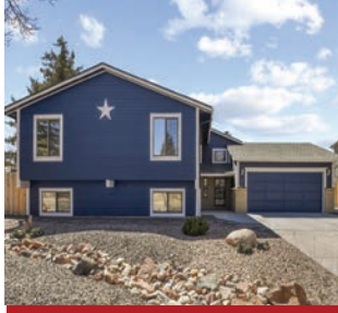
Wedgewood at Briargate COLORADO SPRINGS, CO 80920