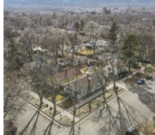
Day/Middle Shooks Run COLORADO SPRINGS, CO 80903