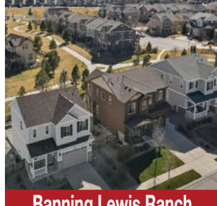
Banning Lewis Ranch COLORADO SPRINGS, CO 80927