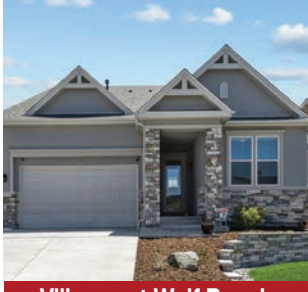
Villages at Wolf Ranch COLORADO SPRINGS, CO 80924