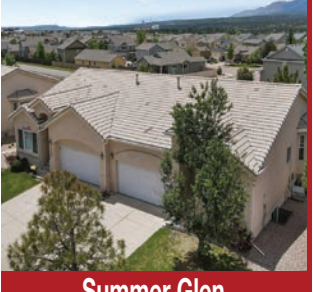
Summer Glen COLORADO SPRINGS, CO 80921