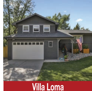
Villa Loma Colorado Springs, co 80917